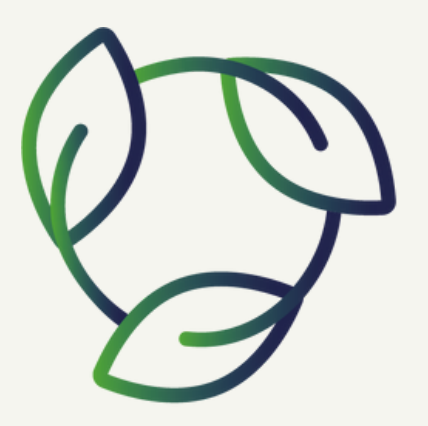
REDUCE ENVIRONMENTAL POLLUTION