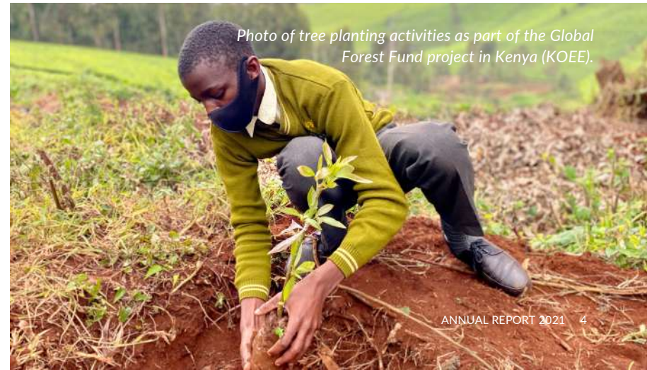
Photo of tree planting activities as part of the Global Forest Fund project in Kenya (KOE).

While the world began to slowly recover from the COVID-19 pandemic, 2021 was still a challenging year for many FEE member organisations, particularly those in the Global South. The COVID-19 pandemic further restricted resources to organisations dedicated to environmental education and ESD, despite the increasingly urgent need to address SDG 4: Quality Education. In response to these challenges, FEE established the FEE Regional African Network (FRAN) made up of representatives from FEE member organisations in Mauritius, Morocco, Cape Verde, Burundi, Ghana, South Africa, Zanzibar, Uganda, Madagascar and Denmark. The aim of the FRAN is to support capacity-building, share best practices and experiences and increase collaboration and financial resources available among the FEE members in Africa. In 2021, an initial meeting was held in 2021 to establish the structure and expected objectives of the FRAN, and bi-annual meetings will continue to be held in 2022.