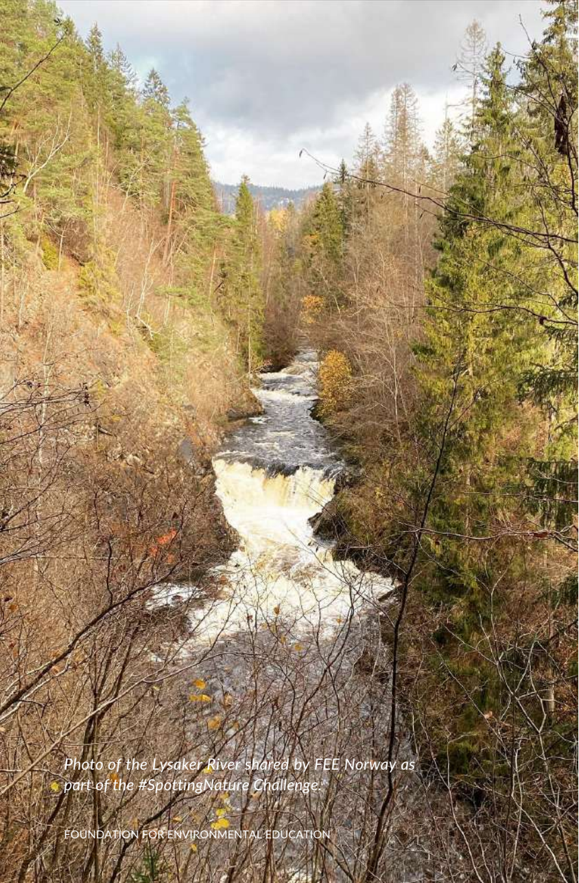
Photo of the Lysaker River shared by FEE Norway as part of the #SpottingNature Challenge.