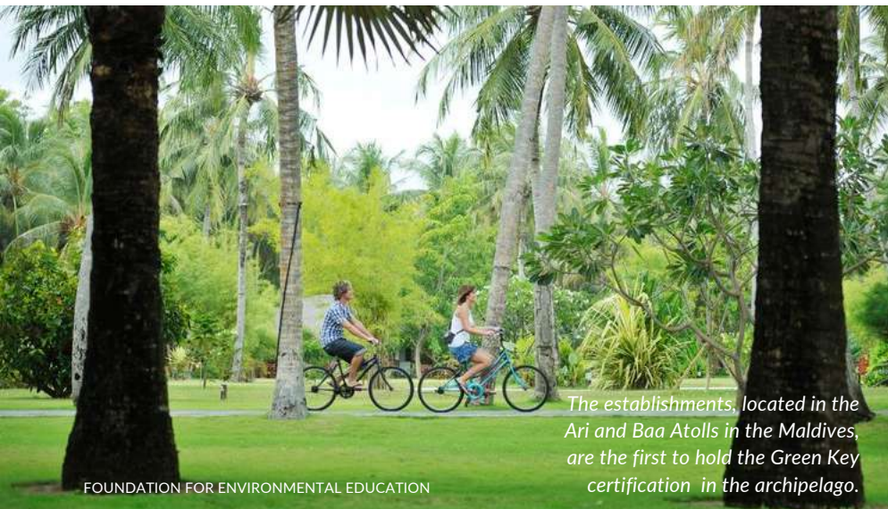
The establishments, located in the Ari and Baa Atolls in the Maldives, are the first to hold the Green Key certification in the archipelago.