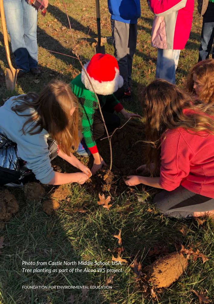
Photo from Castle North Middle School, USA. Tree planting as part of the Alcoa W5 project.