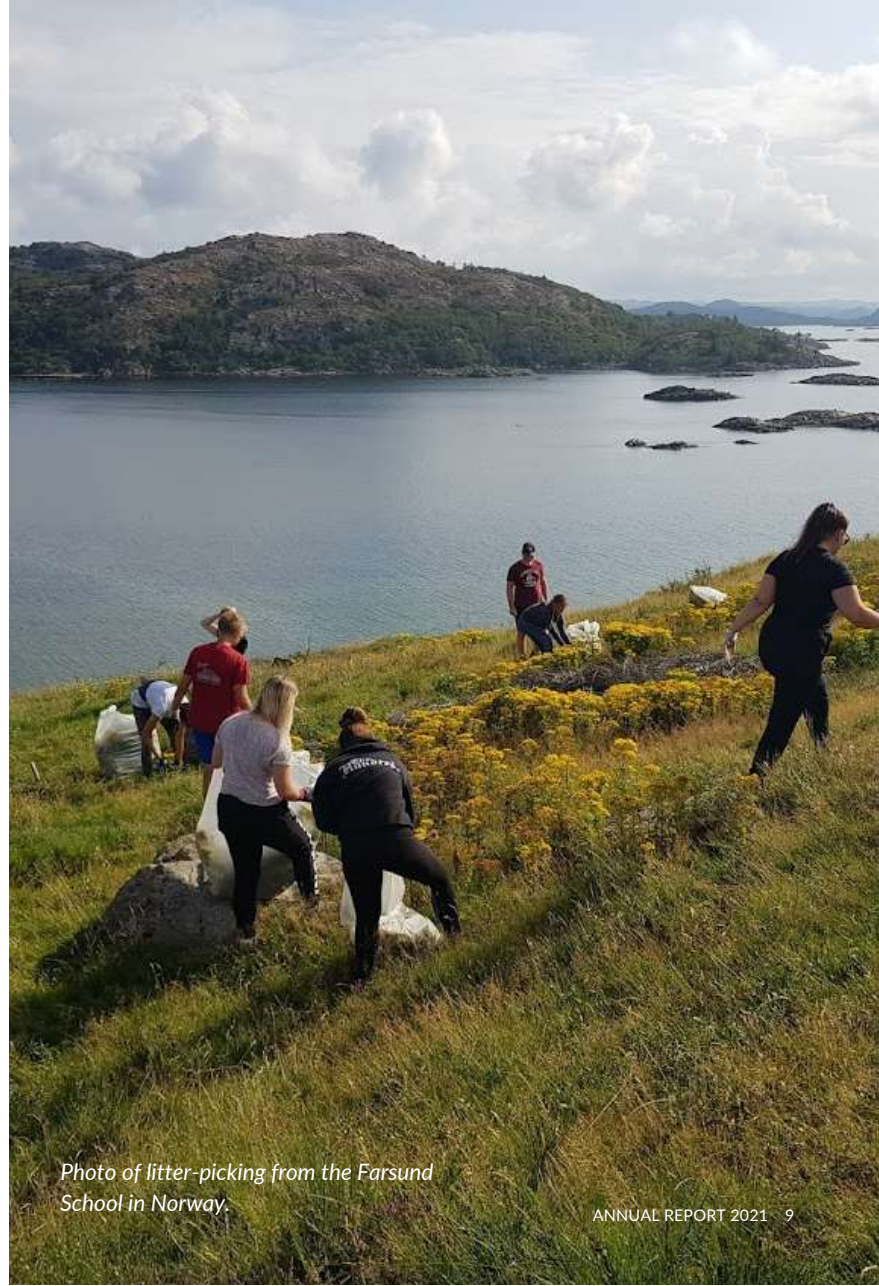
Photo of litter-picking from the Farsund School in Norway.

2021 offered an opportunity for both the Green Key and Blue Flag programmes to revise their programme criteria to ensure they aligned with FEE's priority areas as outlined in the GAIA 20:30 strategy. While Blue Flag will be finalizing their new criteria in 2022, the Green Key programme announced significant changes in the certification criteria for hotels and hospitality establishments. New criteria include, but are not limited to, the monitoring of hotels' carbon footprint, recognizing establishments that have been verified carbon neutral and encouraging guests to compensate their carbon emissions. Climate change education will be included in staff training, and establishments are encouraged to engage staff and guests in climate change awareness activities, such as tree-planting and other climate change adaptation strategies. Several existing criteria were expanded upon, such as criteria regarding litter and waste and the promotion of responsible consumption and production. 2022 will see the implementation of these criteria in the certification and recertification of Green Key establishments.