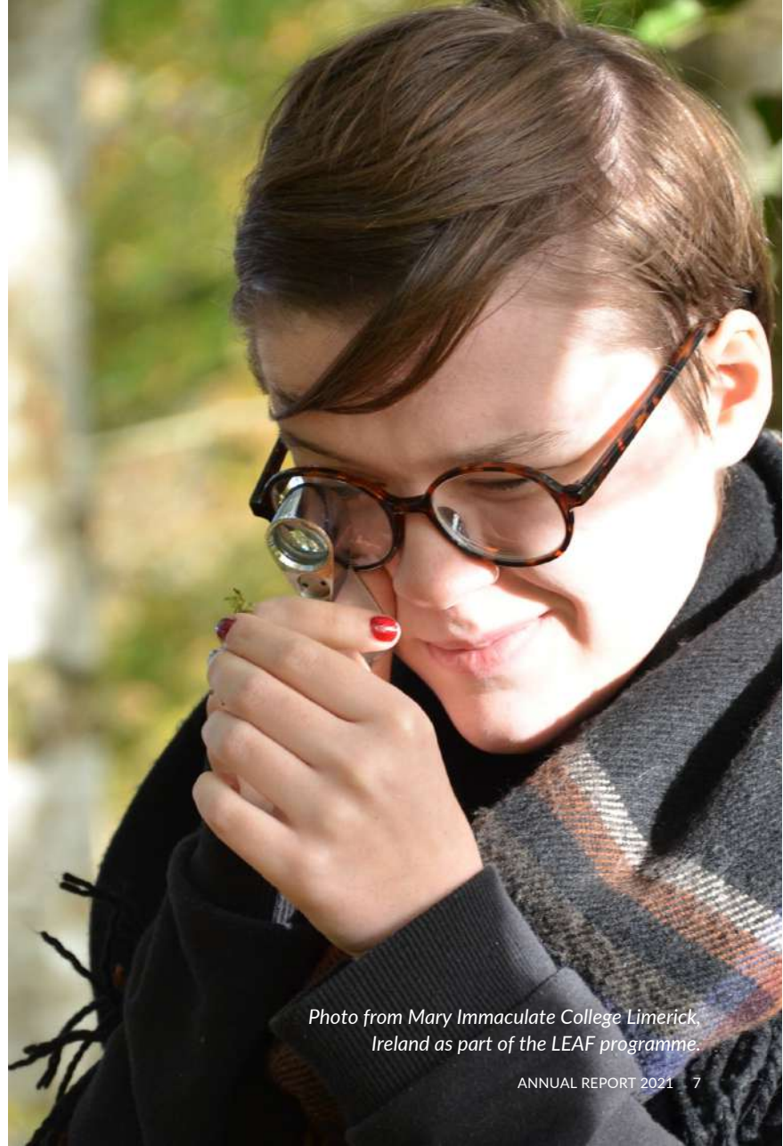
Photo from Mary Immaculate College Limerick, Ireland as part of the LEAF programme.