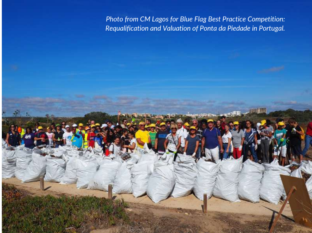
Photo from CM Lagos for Blue Flag Best Practice Competition: Requalification and Valuation of Ponta da Piedade in Portugal.

A long-standing partner, FEE was excited to join UNESCO's ASPnet Schools for their Trash Hack Campaign in early 2021, which aimed to encourage young people to take action to promote sustainable development, reflect on their actions, and share their learnings. As part of the campaign, schools from the Eco-Schools, YRE and LEAF programmes were invited to share their best trash hacks through social media and on the campaign website .