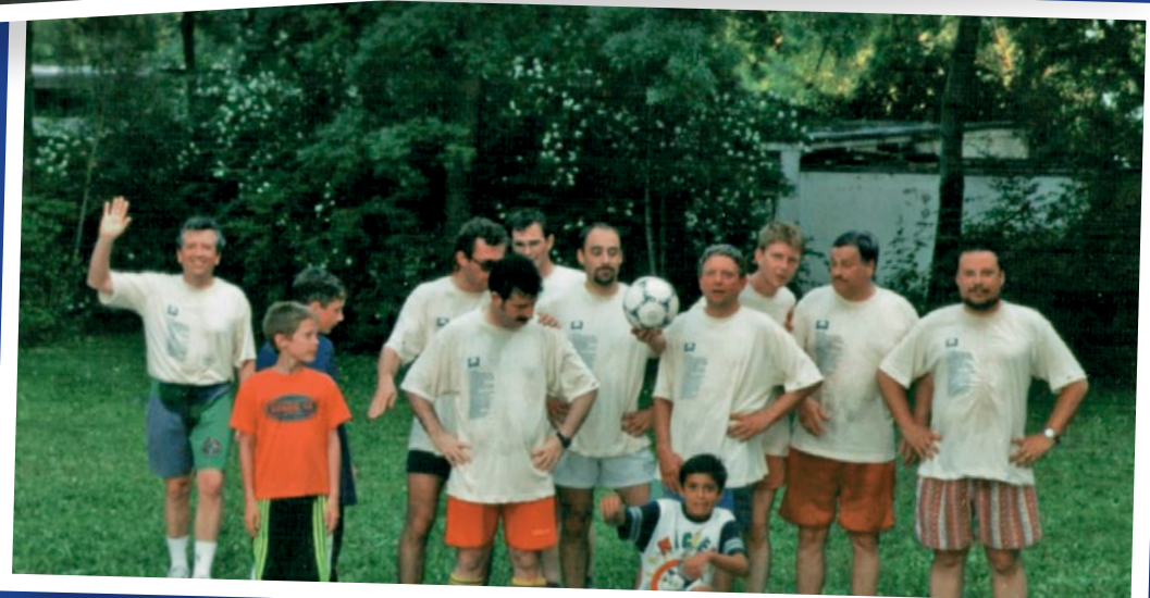
Side Event at the General Assembly 1998, Bulgaria