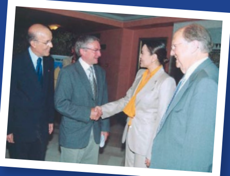
With the Princess of Morocco

Some of the excursions and of the dinners they had planned were extraordinary. Again, as I said, they don't have to be all fantastic in order to be great General Assemblies, but it is something that I still remember. Especially one dinner, which took place in one of the palaces: we were on a pontoon, and the food was the most amazing I had ever tasted. The whole setup was just taken out of 'One Thousand and One Nights': there were musicians on a boat passing by our dinner place; on the other side of the lake there was a person dressed in white on a white horse... it was something really special that I will remember forever.